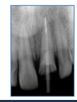
Fig. 12: X-ray showing the length of the fibre post in the canal