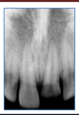
Fig. 9: pre-operative x ray showing fractured cental incisor at CEJ