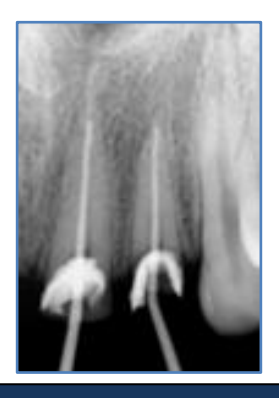
Fig. 4: x-ray showing length of GP point before obturation