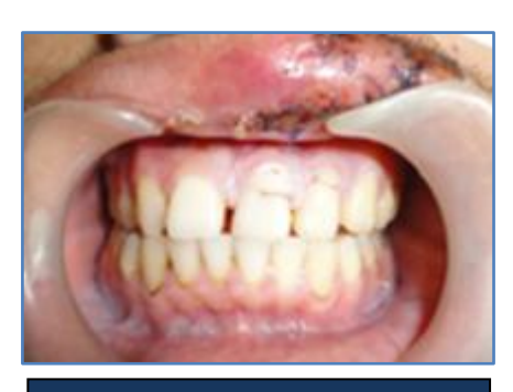
Fig. 1: Fractured anterior teeth (pre-operative)