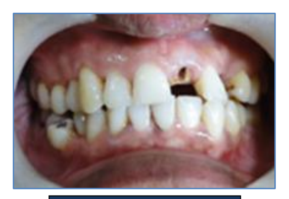
Fig. 8: Fractured Central incisor (pre- operative)