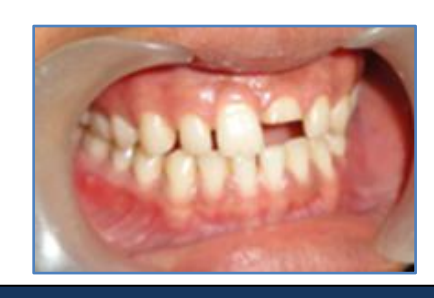
Fig. 20: Fractered central incisor