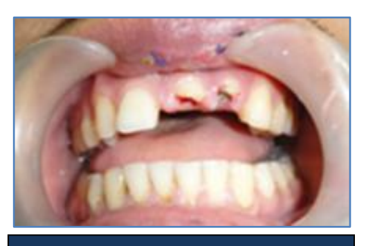
Fig. 3: After root canal treatment