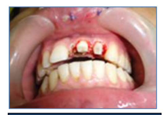
Fig. 6: Core preparation with crown lengthening using laser