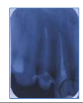
Fig. 18: X-ray showing the fibre post cemented in the lateral incisor