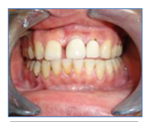
Fig. 7: Restored anterior teeth (post- operative)